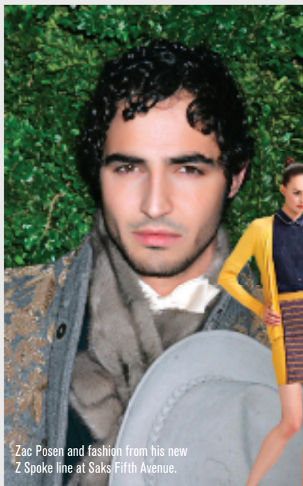
Zac Posen and fashion from his new Z Spoke line at Saks Fifth Avenue.