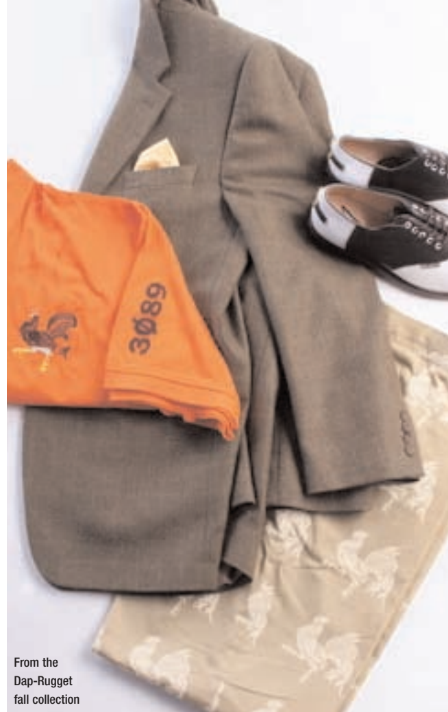
From the Dap-Rugget fall collection